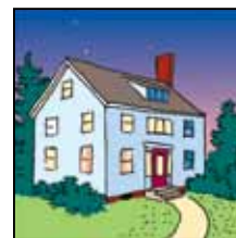
... or home

The archived conference includes speaker videos and coordinated Power-Point presentations.